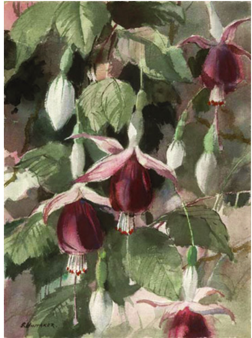
Fuchsias Frederic Whitaker, 1965 From the Frye Art Museum Collection

Take a trip to www.whitakerwatercolors.org ! To order from our new website store, click on "store."