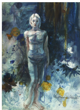
A Blue Mood