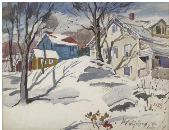
Winter, New England Frederic Whitaker, 1950s