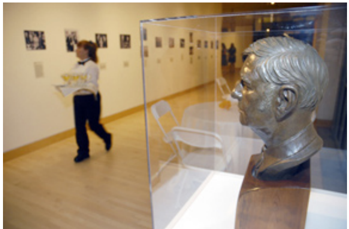
A bronze bust of Frederic Whitaker watches over photographs from the couple’s lives

Photos documenting the lives of both artists were a featured part of the exhibit presentation.