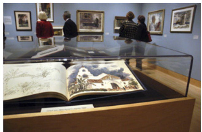
Contrasts That Complement , a recently published book about the Whitakers (see page 7)